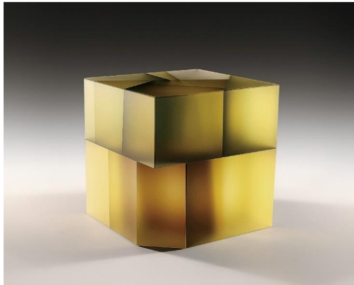
Cell Cube with Purple Manipulation, 2012, Optical cast glass, cut, laminated

(2012.4.4. purchased with funds from Corning Incorporated in honor of Chairman Kun-Hee Lee of Samsung)