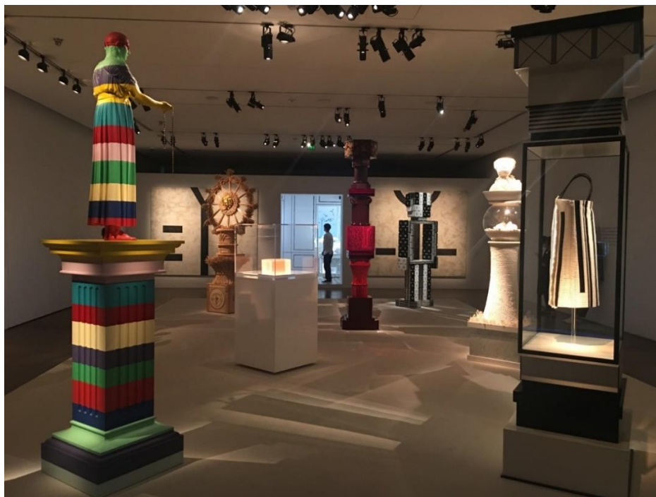
<마드모아젤 프리베 서울>전 전시 전경 (디뮤지엄)