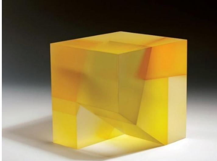
Samsung hee's collection, 2011