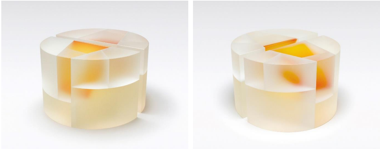
Mitosis , 2019, optical glass, h22 x w36 x d34 cm 프랑스 파리장식미술관 전시 개최 (2021년 5월)

2020, The LOEWE FOUNDATION Craft Prize 2020 Finalist 선정 작품